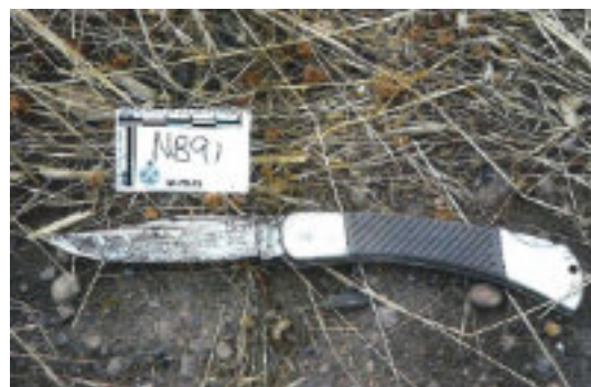
Above: The 'miraculously' appearing' – but short – knife.

Having served more than a decade in jail, his conviction was overturned in 2020. The WA DPP decided to proceed with a new trial: he could have decided not to.