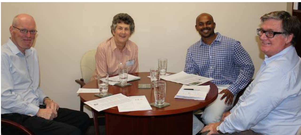
CLA President meeting with Charles Darwin University academics in 2011.

CLA makes the above comments to stimulate discussion in the NT about where the government and the legal/justice system is headed as statehood approaches.