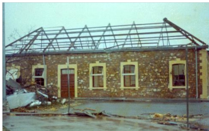
Brown's Mart...as it was on the day of the inaugural meeting of the NT CCL.