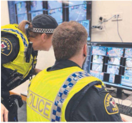
Officers examine live CCTV footage from Hobart's CBD.