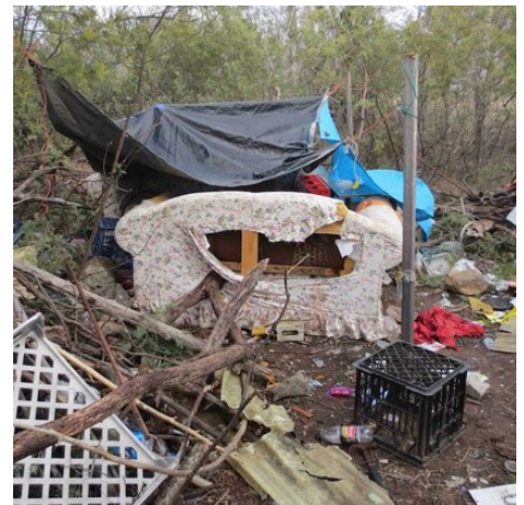
Photo: Makeshift homeless shelter, removed by government. PIC credit: Johnscotaus, 4 Apr 2015

State: Abolition of mandatory sentencing; abolish long sentences for children (replace with education and support programs); campaign every state and territory against homelessness until it is 20% of what it is in 2016; stop jailing people with mental health and other disabilities; upfront restoration cost paid by local and international miners for remediation and to repair site degradation (held in trust); keep people out of jail using alternative 'community help' projects; more funds for primary education, education of prisoners also; ensuring state schools have equivalent infrastructure (pools, gyms, etc) to that of private schools; remove the new anti-protest laws sweeping the states; stop forced council amalgamations; MRI scan and psych tests for politicians to ensure they are 'fit-for-purpose' before starting their political career (and as a 'benchmark' for comparison during or at the end of their careers).